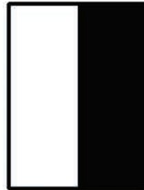
1/2 Page Vertical 3 3/8" x 10"