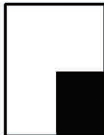
1/4 Page 3 3/8" x 4 7/8"