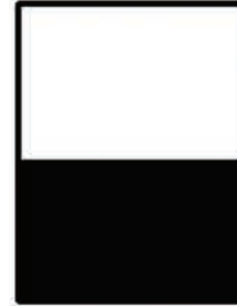
1/2 Page Horizontal 7" x 5"