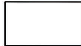
Business Card 2 1/4" x 4 7/8"