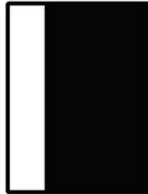
2/3 Page 4 3/4" x 10"